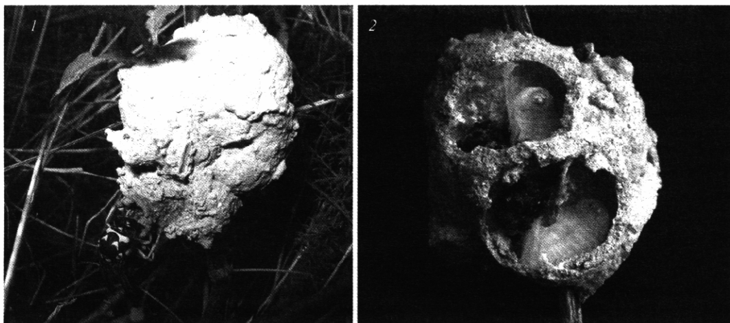
Fig. 1. Nesting of Eumenes punctaticypeus kostylevi : 1 — the nest N 2 attached to a bush stem with female constructing the cell collar; 2 — the same nest dissected after exposition; one can see two-layer cocoons with lumps of preys' remains and preys' feces between layers and prepupae inside the inner layer.

The nest N 2 was attached to a bush stem in the grass layer and consisted of six cells made of biscuit soil mastic. In the moment when the nest had been found, a female was building the collar of the sixth cell (fig. 1, 1). The nest was transported in the laboratory where it was examined. It was 28 mm in the long axe (along the stem) and 26 mm